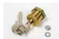
Release lock with customised key