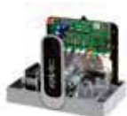
E721 electronic control unit (incorporated in automation) Info at page 151