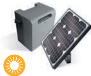
SOLEMYO KIT The solar power to automate gates, garage doors or barrier gates. See page 229.