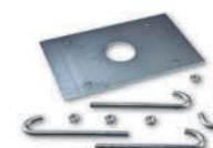
SIA2 Anchorage base with clamps.