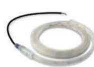
XBA6 Indicator lights for click fixture on upper or lower side of bar. Length 6 m.