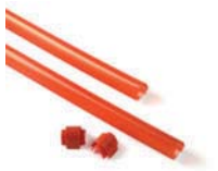
XBA13 Rubber impact protec- tion strip. Length 1 m. Pc./Pack 9