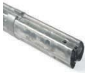
XBA9 Expansion joint.