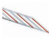
WA13 Aluminium rack up to 2 m.