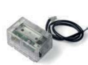
XBA8 Integrable traffic light.