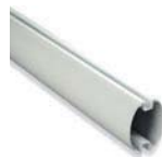
XBA5 White paint-finished aluminium bar 69x92x5150 mm.