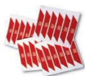
WA10 Red adhesive reflector strips.