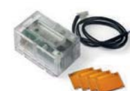
XBA7 Integrable flashing light.