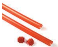
XBA13 Rubber impact protection strip. Length 1 m.