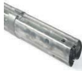
XBA9 Expansion joint.